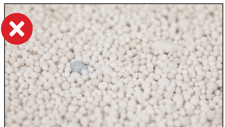
Blue granules are sparse and/or faded