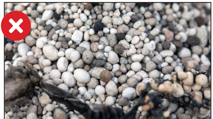
CellBlockEX shows signs of a thermal event