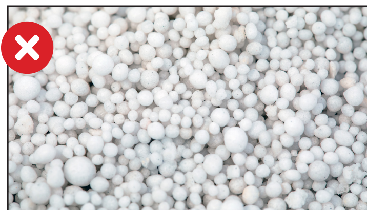
No blue granules present