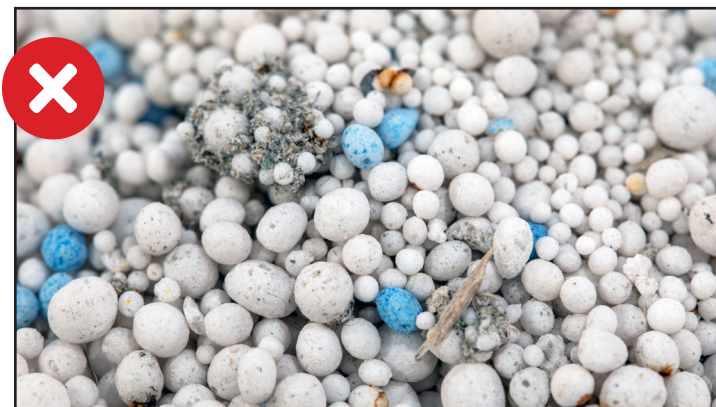
CellBlockEX is contaminated or dirty