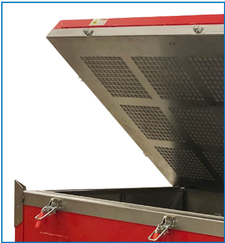
CellBlockEX gravity-fed extinguishing system in the lid. Rechargeable.