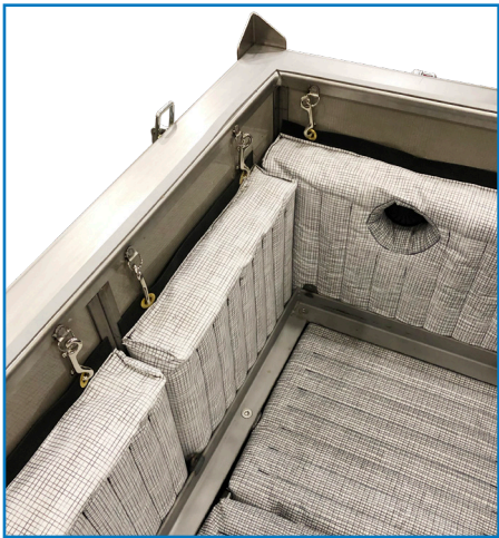
Custom-fit fire-suppression cushions fill negative space to provide additional protection.